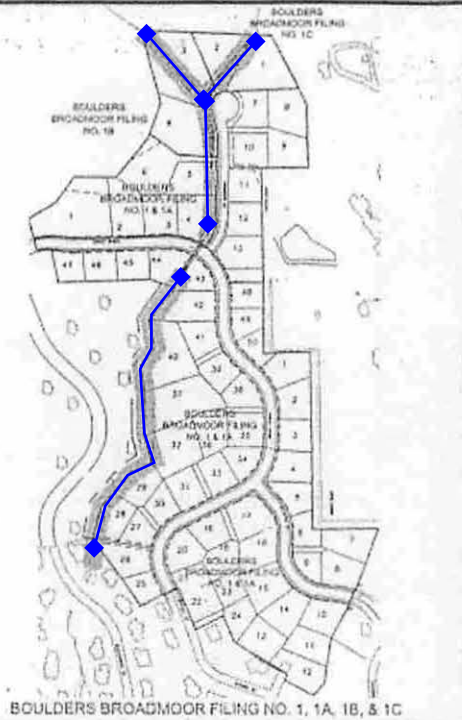
BOULDERS BROADMOOR FILING NO. 1, 1A, 1B, & 1C

OFFSITE DEBRIS FLOW BASINS ARE LOCATED WEST OF SPIRES BROADMOOR FILING NO. 1